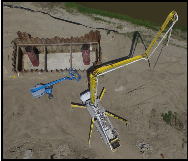
View from above placing the bridge columns.