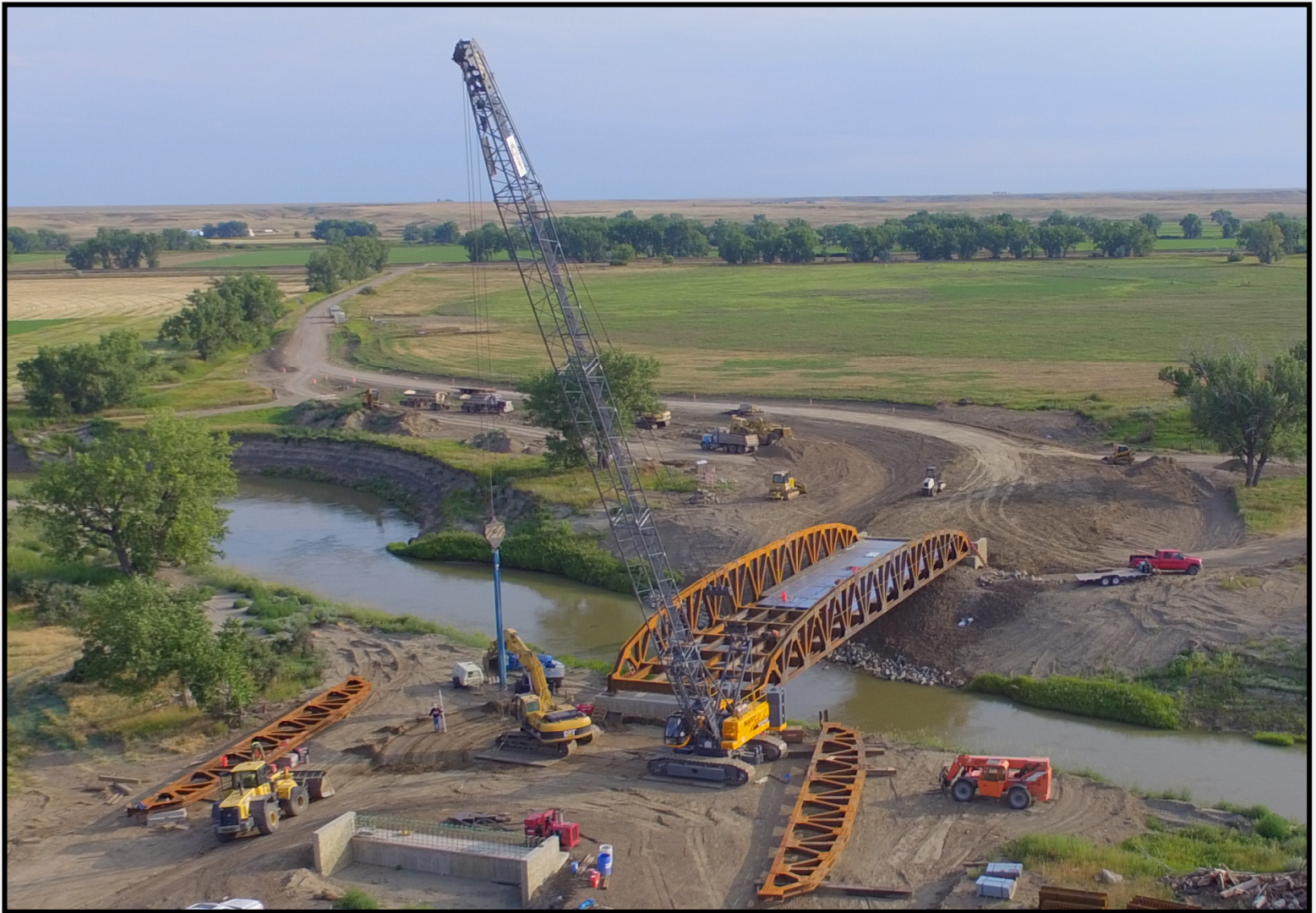
Installation of the two shorter trusses.