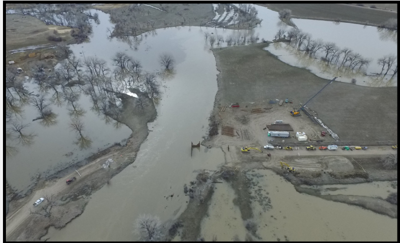
Milk River flooding April 23, 2018.

Below: Preparing for the concrete deck pour.