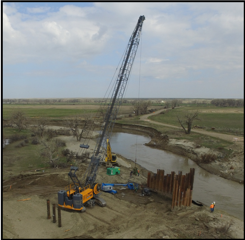
Installation of the Bent 2 cofferdam.