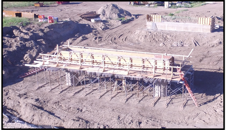
Bent 2 pier cap.