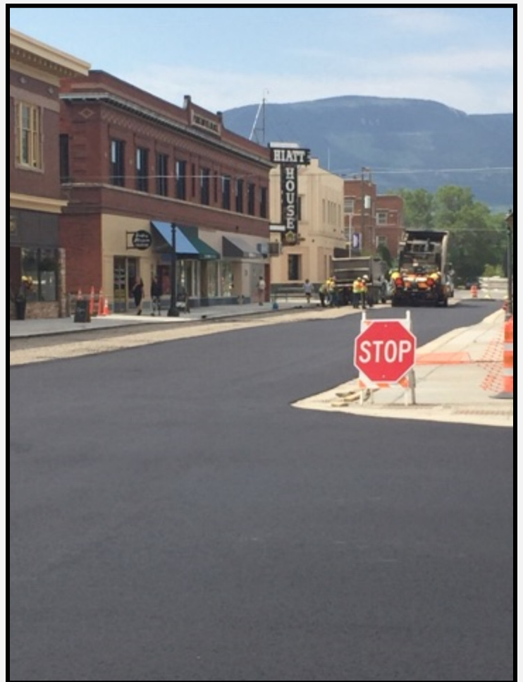
Paving Callender Street in downtown Livingston.