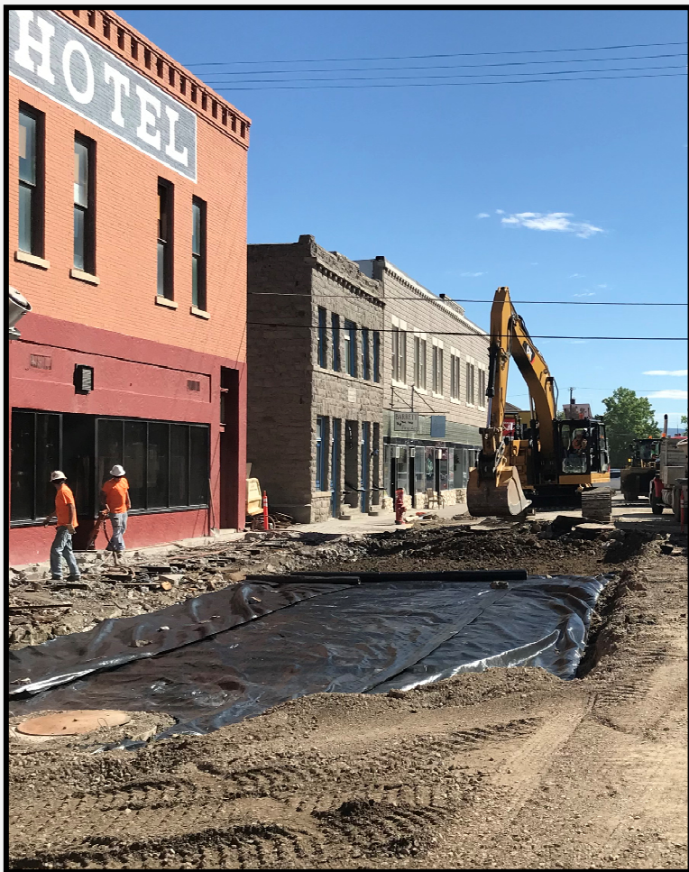
Street excavation on Callender Street.