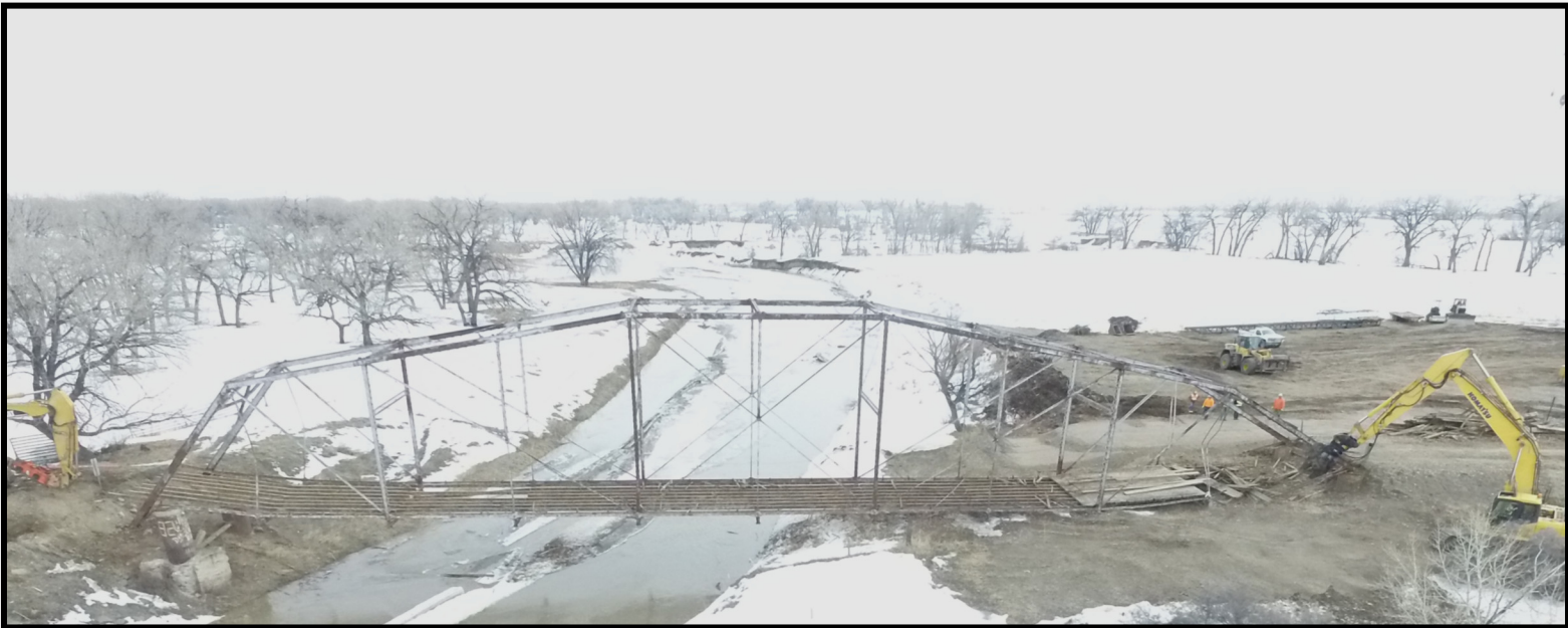
Demolition of the existing truss bridge.