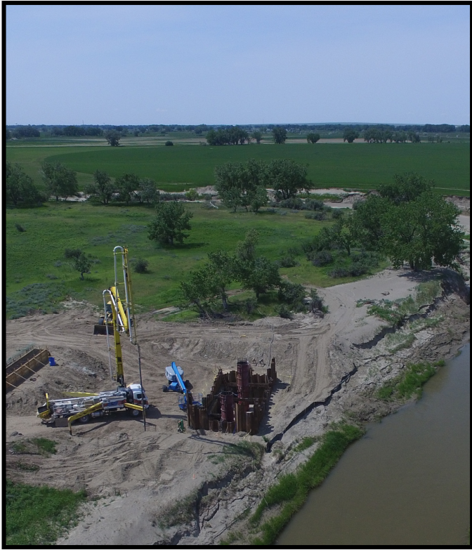
Bridge column replacement.