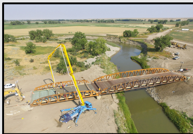
Pouring the bridge deck on the new 2 span steel truss bridge.