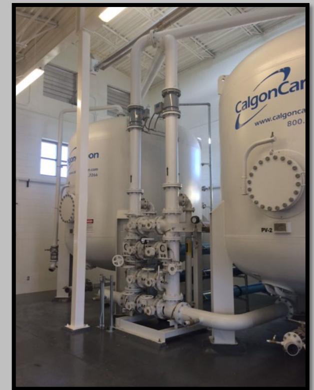
Granular Activated Carbon Absorption System (GACAS)