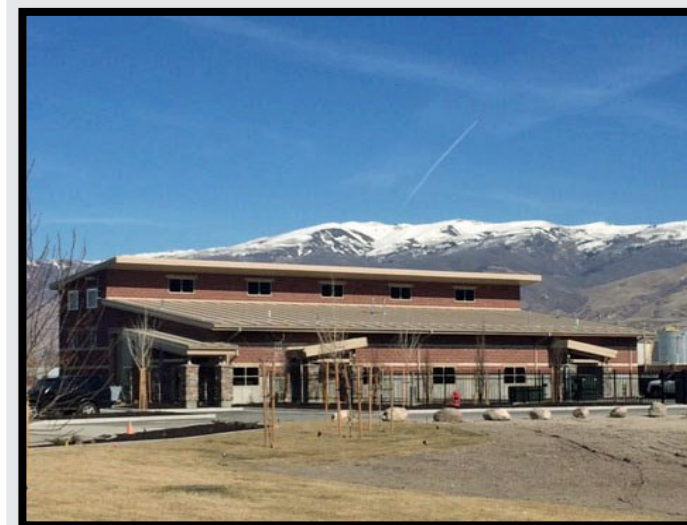
Woods Cross Drinking Water Treatment Facility