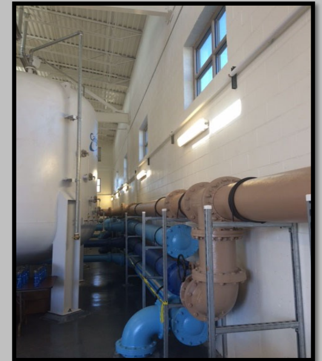
Granular Activated Carbon Absorption System (GACAS)