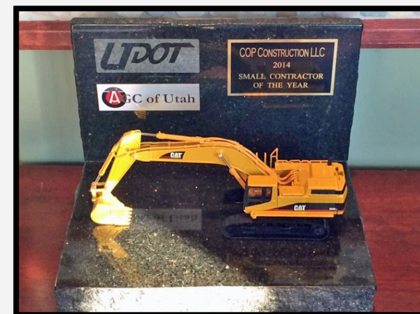
UDOT/AGC 2014 Small Contractor of the Year Award