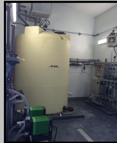
Sodium Hypochlorite Disinfection Room