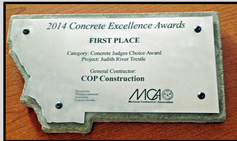
2014 Concrete Judges Choice Award for our Judith River Trestle Project.