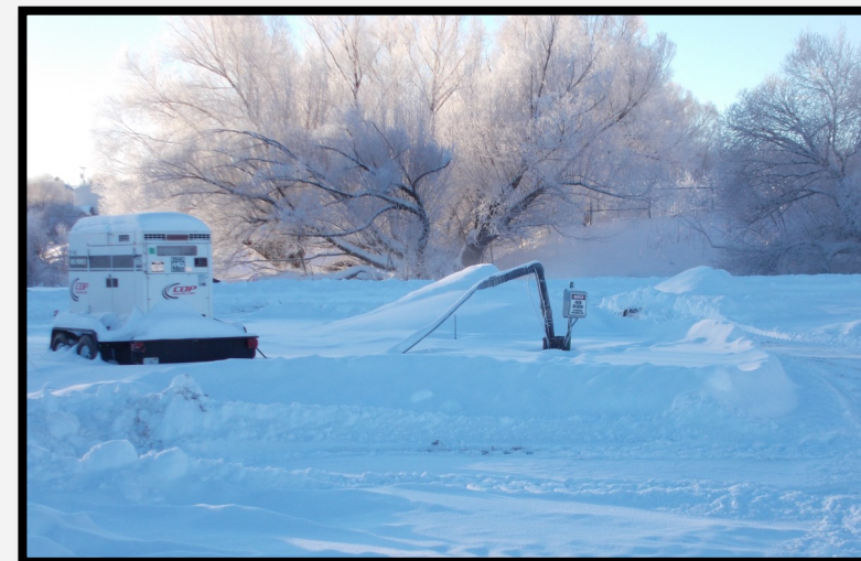
One of several snowfalls.