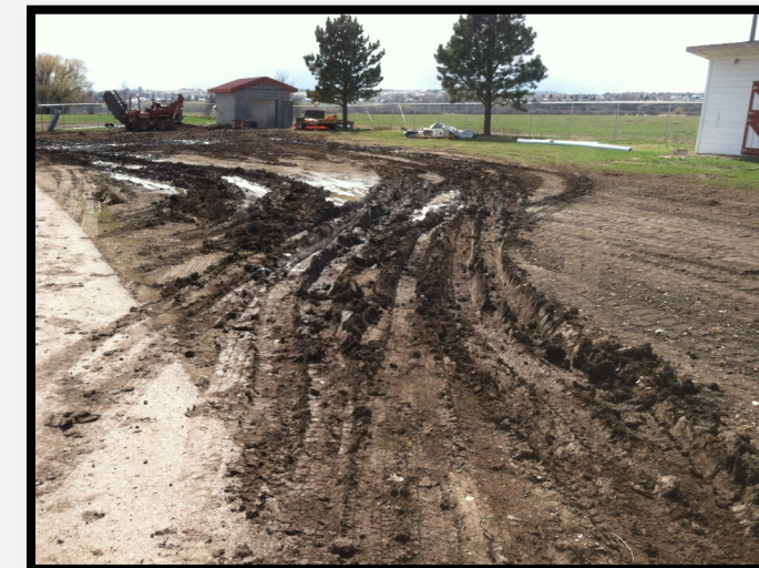
Typical ground conditions.