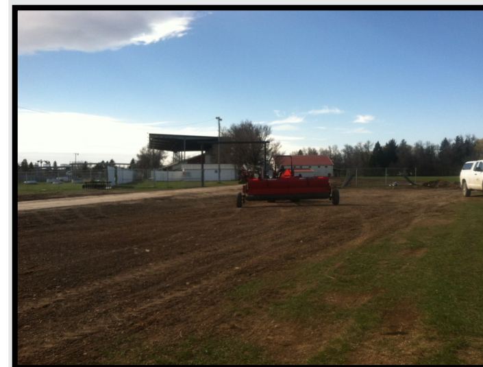
Reseeding after project completed.

The Fergus County Fairgrounds project was the construction of a new water and sewer system whose main function was for the development of 42 camp sites within the facility. The project was bid jointly by Ed Allen and Christian Duffus, with an original contract amount of $1,515,771. After change orders, the total amount was