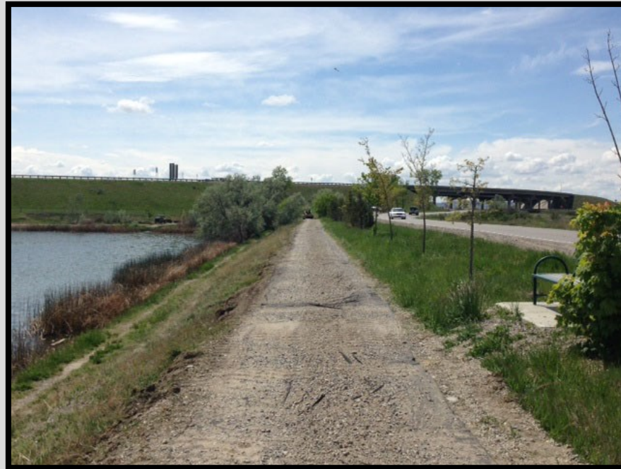
Laurel Pond Pathway