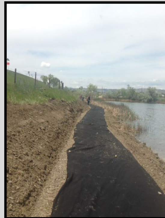
Geo-Tech Fabric on Pathway