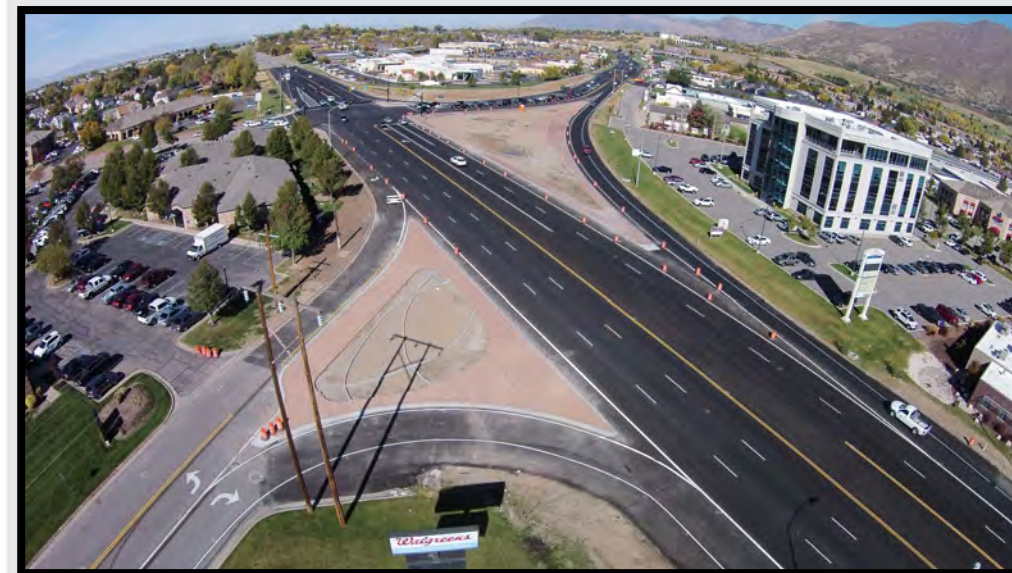
Aerial view of completed project.