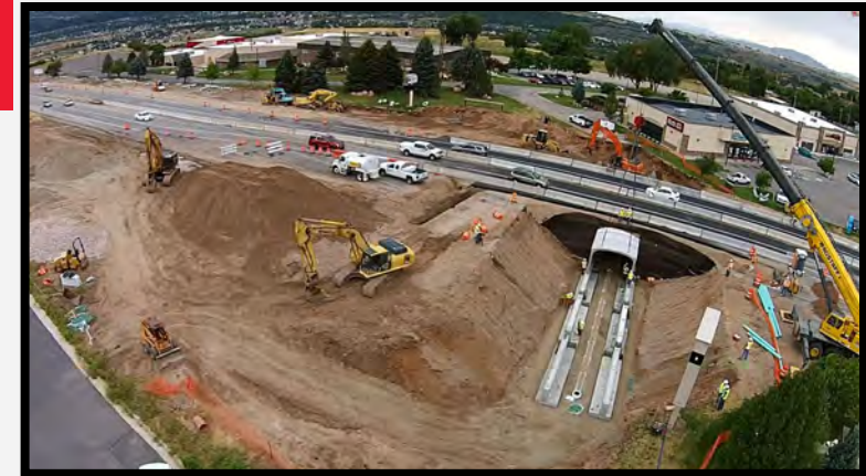
Installation of Pedestrian Tunnel.