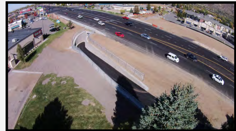
Completed Pedestrian Tunnel.