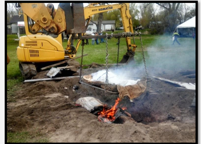
COP Construction style pig roast.