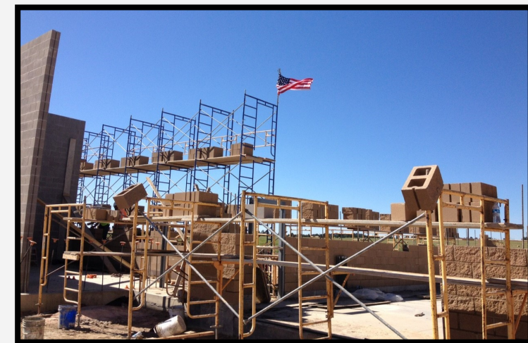
Block Wall Installation