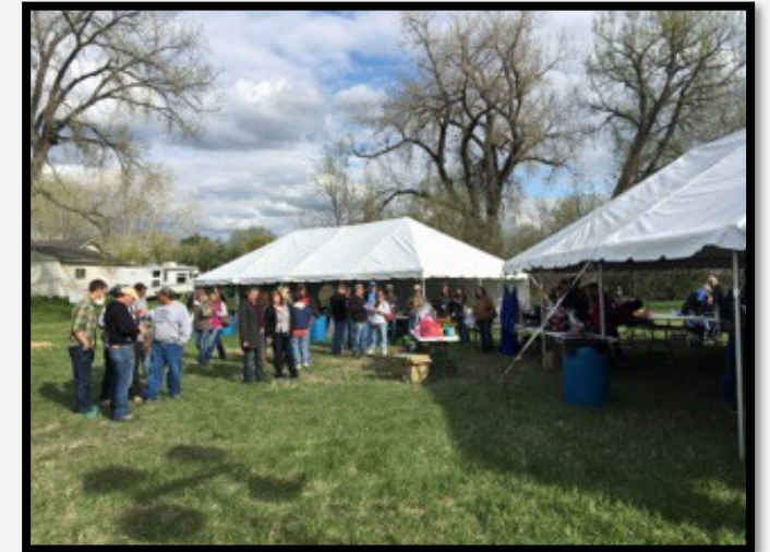
Tents set up for the outdoor fundraiser.