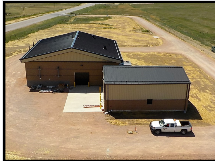
Pine Ridge Disinfection Facility building.

Gillette, Wyoming- COP Wyoming LLC was awarded the $5,730,000.00 Madison Pipeline Pine Ridge Disinfection Facility Contract #7 project in late December 2014. The project began on March 16, 2015.