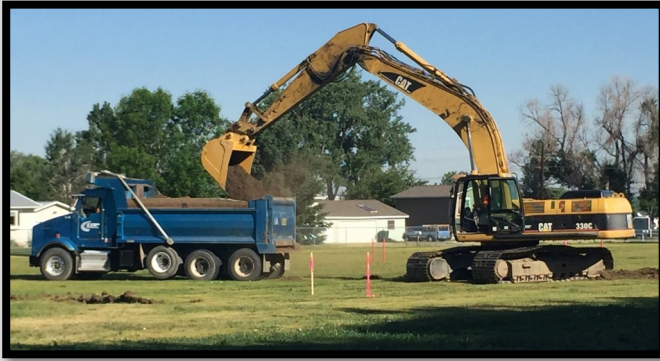
First load of dirt.

Lockwood, Montana — Lion's Lair 2.0 project is an inclusive playground structure at Lockwood Elementary School. COP volunteered their services to excavate approximately 800 cubic yards of material for the playground and sidewalk areas. COP will be donating 140 man-hours, plus equipment which included an excavator, skid steer and 3 end-dump trucks to haul off and dispose of the 800 cubic yards of material. Lockwood PTA, Lockwood Elementary School teachers, students and the community were all out to celebrate the groundbreaking celebration on the morning of June 8, 2016. There was much anticipation and excitement in the air at the ceremony, and COP was happy to help! For more information on Lion's Lair 2.0, you can visit the Lockwood PTA Facebook page or Lockwood Elementary School website.