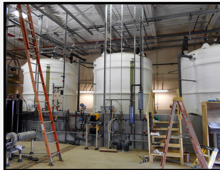
Sodium Hypochlorite Storage Tanks and System Piping