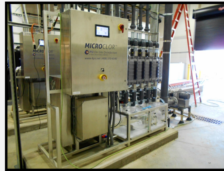
Chlorine Generation Units