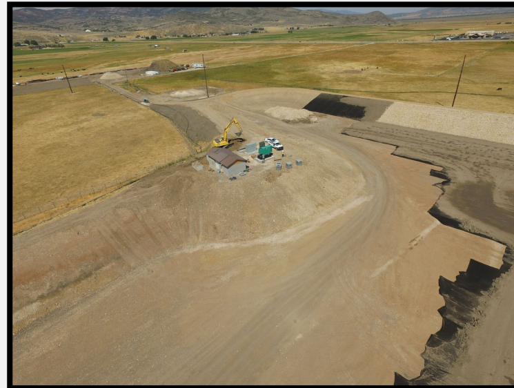
Aerial view of the pump house.