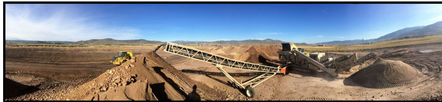
Panoramic view of the jobsite.