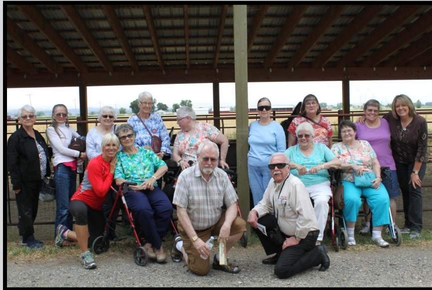
Aspen View group enjoying Angel Horses facility.

As welcome as the Cavalry; the COP Construction's trucks and their volunteer drivers showed up week after week to do cleanup work for Angel Horses future home. Always with a smile and a let's "giterdone" attitude, as the trucks pulled out with the loads the place began to shine.