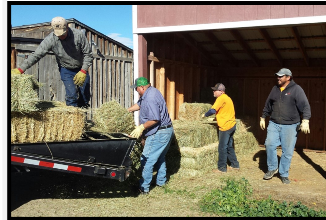
COP boys unloading hay at Angel Horses facility.