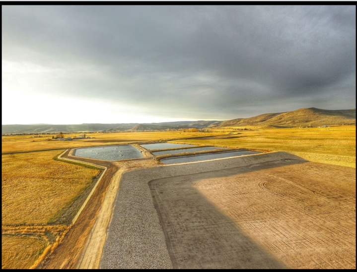
Aerial view of the project.

Kamas, Utah- COP Construction was awarded the Francis WWTF Expansion project in Kamas, Utah, in the spring of 2015. Bruce Despain bid the job at $6,114,830.00 and the project began in June of 2015. This project consisted of 8 operators, 4 craftsmen, 6 electricians, 3 drillers, 8 liner craft, 5 dredgers, 2 QA techs and 6 general laborers. The