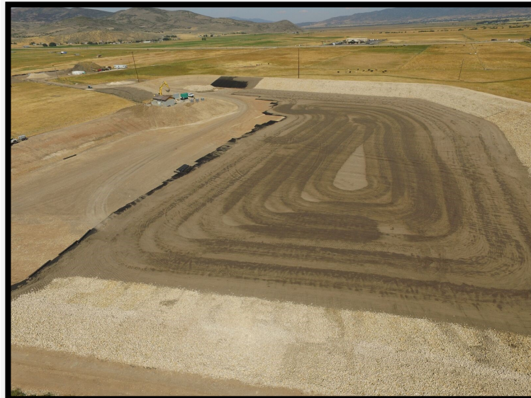
Aerial view of the pond.