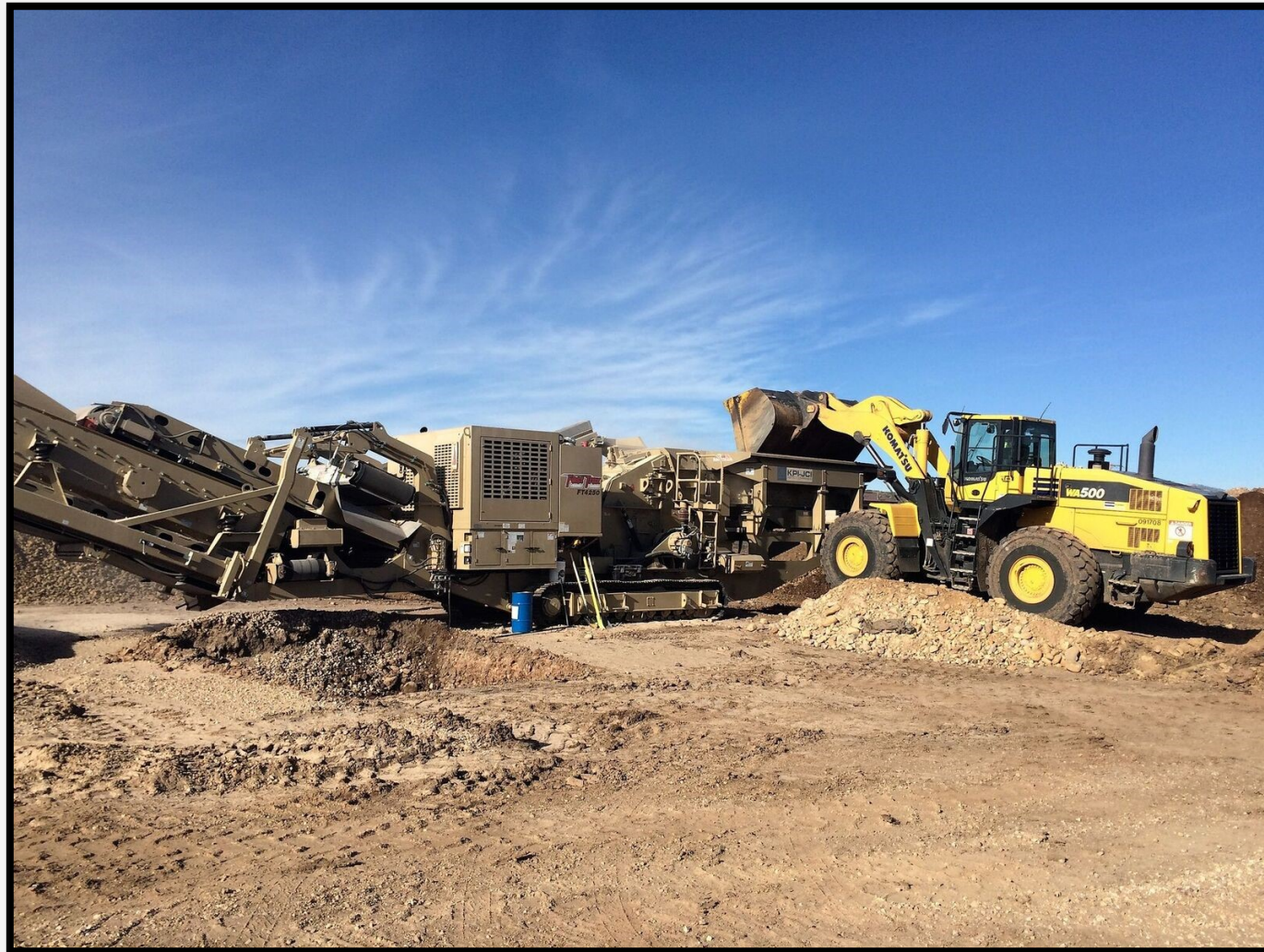
Equipment used on the project.