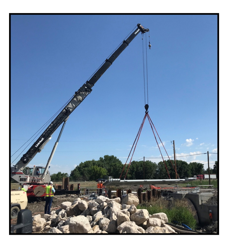
Gate installation. Setting the gate with a crane.