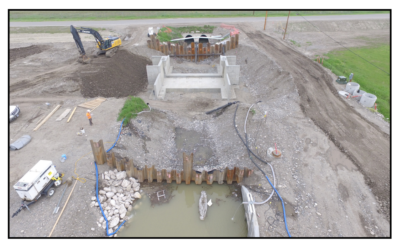
Completed concrete structure prior to gate installation.