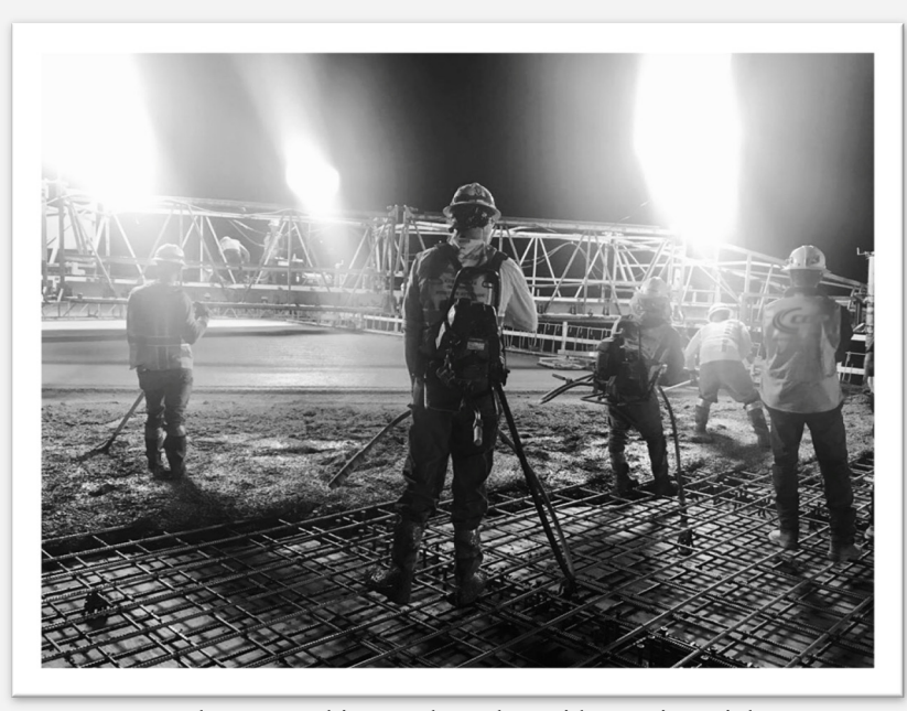
COP employees working on the Echo Bridge project night pour.

As I visit our jobsites and offices, I am always impressed with the skills and abilities of our employees, regardless of position. While