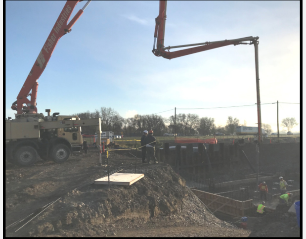
Pouring the base slab for the gate structure.