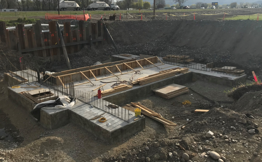
Gate structure base slab.