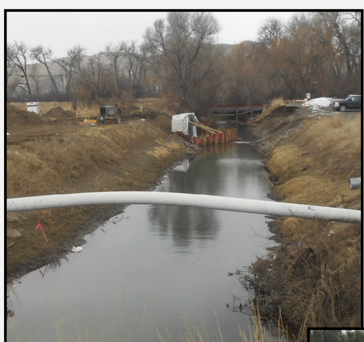
Bypass pipe installation.

Major subcontractors on this project are: Forterra; Fisher Sand & Gravel; and SteelFab.