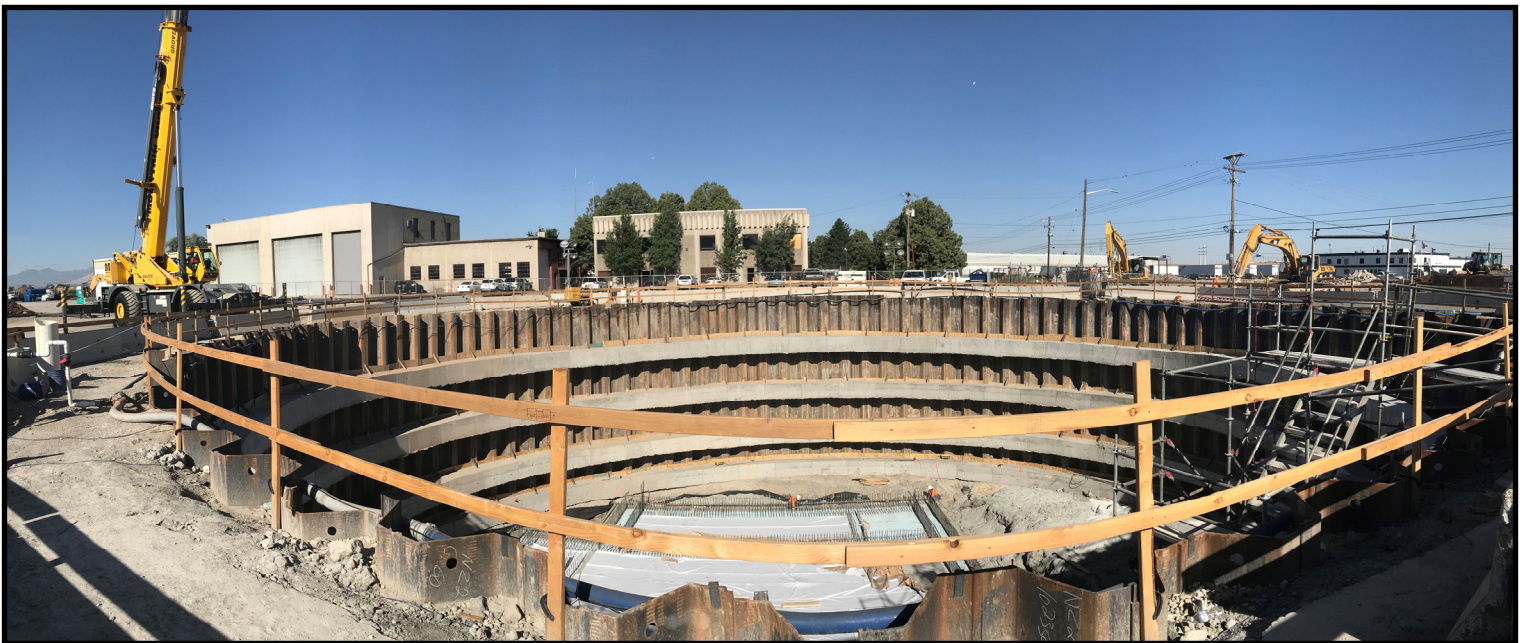
The shoring and excavation for the 45-foot-deep structure with 75-foot sheets by DDF.