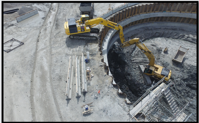
Aerial view of the pump station excavation.

Salt Lake City, Utah - The 500 South Diversion, Phase II - Pump Station project is located in Salt Lake City, Utah. The owner is Salt Lake City Department of Public Utilities. The project is valued at $13,385,485.75. Jared Nessler, Nathaniel Voss, and Lawrence Triolo are the managers of the project and Jeff Pitts and Jessy Meyer are the superintendents. The Notice to Proceed was issued December 5, 2017, and the project began in January 2018, with an anticipated completion date of December 1, 2019. The project includes construction of a pump station, including the associated vaults, sewer pipeline installation, onsite excavation, dewatering, shoring, site-work improvements, and all other activities needed to complete the work. It has also been necessary to protect and maintain access to onsite buildings and facilities. The pump station building will be constructed 45-feet below grade with cast-in-place concrete, with CMU block 20-feet above grade.