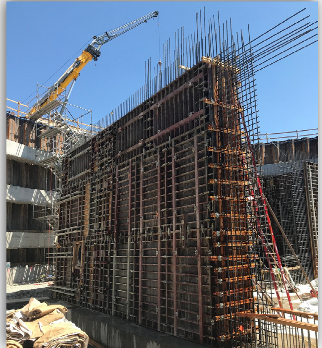
Concrete forms constructed to pour the walls of the structure.