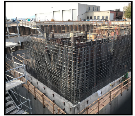
Concrete forms constructed to pour the walls of the structure.