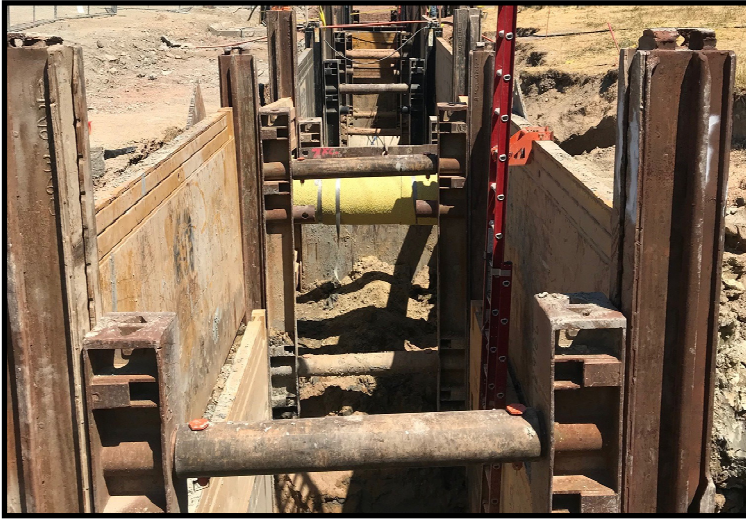
Installation of the new 48-inch sewer, 25-feet deep.