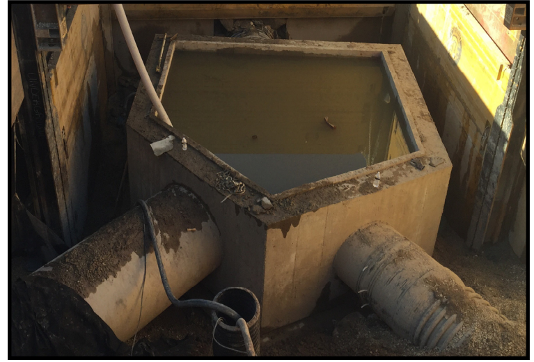
Cast in place base for the diversion structure. Approximately 23-feet below grade and intercepting the existing 36-inch sewer main.