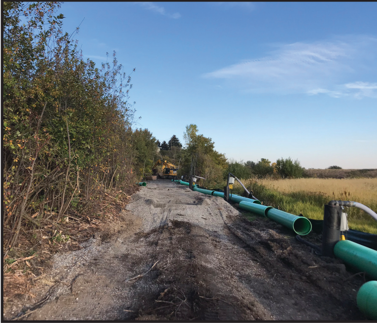
Dewatering wells through the wetlands.

Subcontractors and suppliers used on the project were Core & Main, Anderson Precast, Knife River, BIG TWIG Tree Care, High Country Paving, Coleman Construction.