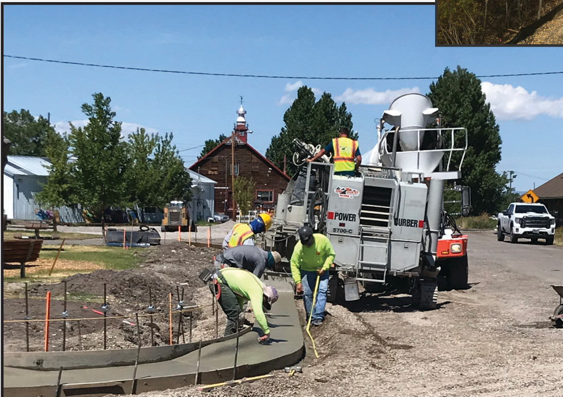
New curb and gutter on Front Street.