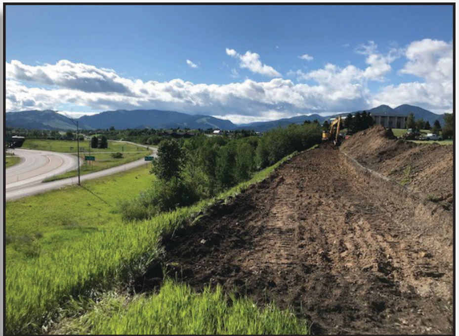
New sewer main alignment along Haggerty Lane.

Bozeman, Montana The Front Street Interceptor project was located in Bozeman, MT. The project included the installation of 7,600 linear feet of 18 inch, 21 inch and 24 inch gravity sewer main, jack and bore crossings under both East Main Street and the Railroad. New gravel access roads and a substantial amount of dewatering was also part of the project. The purpose of the project was to accommodate new development along East Main Street, Haggerty Lane and any expansion at Bozeman Deaconess Hospital. The new main passed through the Montana Department of Transportation right-of-way, over 3,000 linear