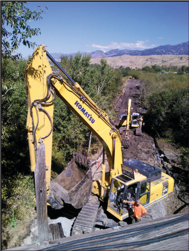
Sewer main installation through the wetlands.

feet of wetlands, under railroad right-of-way and under an old railroad bridge that was converted to a walking path. The new sewer main ranged from 8 feet to 18 feet in depth and approximately 75 percent of the length of the project required significant dewatering. Over 80 dewatering wells were jetted in to control ground water. Other challenges on this project included approximately 13 existing utility crossings in the first 500 feet of the alignment along with a fiber optic line and a gas line running parallel to the new main. There was about 1,200 linear feet of the new pipe alignment that went through the yard of one of Bozeman's biggest lumber yards. Coordination with their delivery trucks was critical. The project began on June 22, 2020 and was completed on October 27, 2020. Eric Smith was the Project Manager, Shane Sheridan was the Superintendent, Josh LeFevre was the Project Engineer and Christian Duffus was the Estimator on the project.