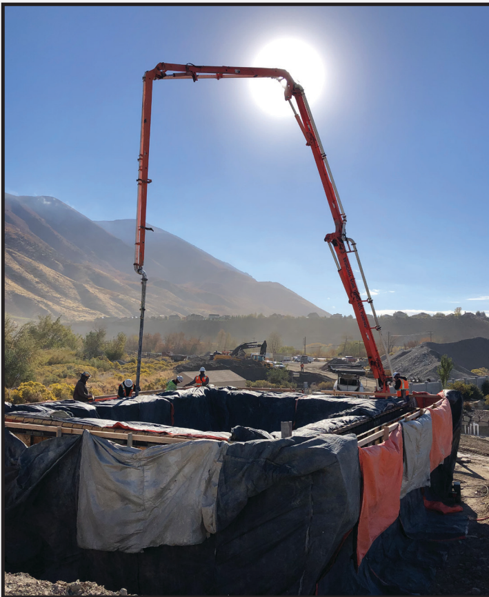
Pouring the pump station walls.

Special THANKS to the COP team for the safe and quality work performed. You planned out your work and executed it to plan. Great Job! Also, a SPECIAL THANKS to the Central Utah Water Conservancy District team and Horrocks Engineering for great communication and teamwork, it has added to the success of the project.