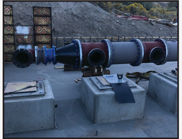
Installing 3 each vertical turbine pumps and mechanical piping inside the pump station.