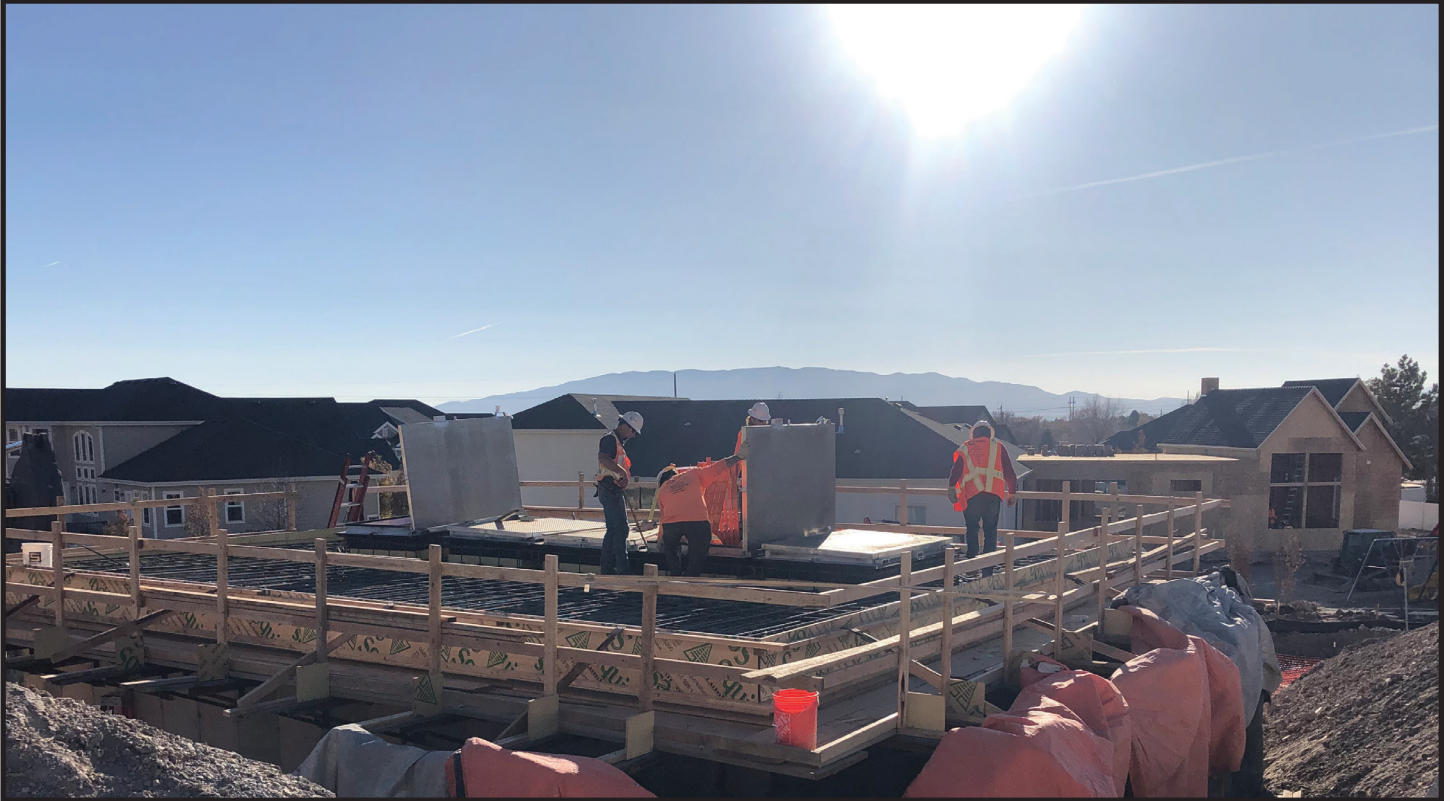
Installing 4 roof hatches that cast in the pump station lid. They provide access over each of the vertical booster pumps.