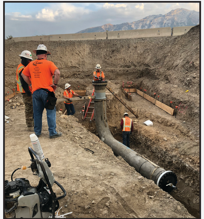
Installing the 20-inch spool that gets encased below and before the pump station structure.