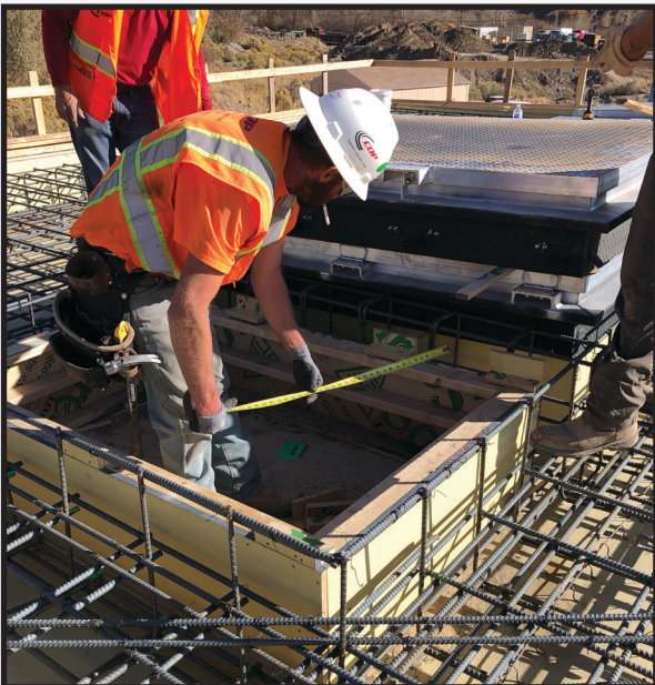
Completing the final touches in prep for casting the pump station lid.

Subcontractors and suppliers used on the project were HD Fowler, Double D Electric, Rocky Mountain Fabrication, Nickerson Company, Kilgore, Alta View Rocky Mountain Valves & Automation, United Team Mechanical, APCO, Western Fence, Geneva Pipe, Terracon, Orion Painting & Coatings, and Redcon Land Surveying.