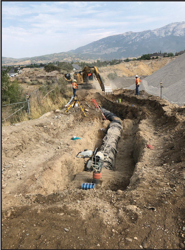
Installing a section of 24-inch ductile iron pipe along the 3,146 linear foot alignment.

The project included clearing 3,200 linear feet of heavily vegetated vertical terrain to install 3,146 linear feet of 24-inch TR Flex piping, connecting the new concrete cast-in-place pump station to the existing Alpine City Healy Well. COP Construction installed 108 linear feet of 20-inch TR Flex piping between the new pump station and the existing vault that required mechanical modification to up-size to 20 inches. The new system required a new concrete cast in place surge tank vault to accommodate the new 8-foot diameter 6,000-gallon surge tank and mechanical piping. The new pump station has 4 each vertical booster pumps and the system had a total of 27 valves up to 20 inches. The new pump station required installing new electrical service, Scada, HVAC, insulation, painting, stone veneer, stucco, membrane roof, and site fencing. The 24 inch pipeline included 3 each 7 feet diameter air vac vaults, 3 each 4 feet diameter sump drain vaults, full length fiber conduit, restoration and seeding.