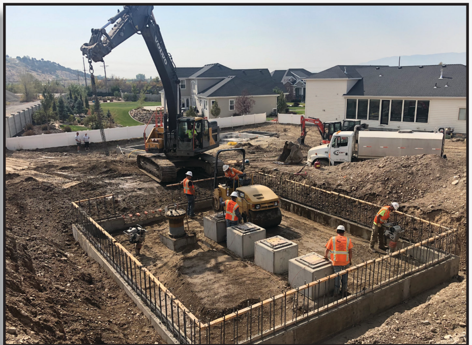
Backfilling pump station in preparation for a slab on grade pour.