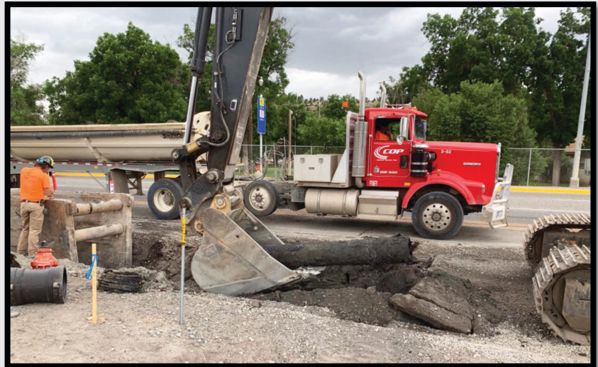
Removal of existing watermain.