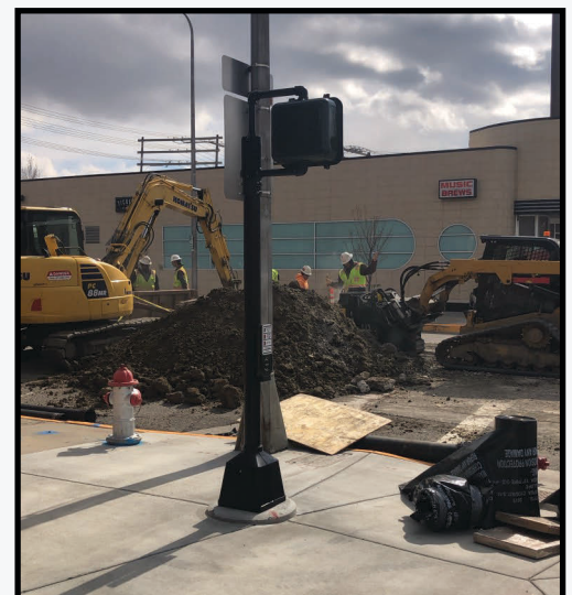
Tying into 25th Street