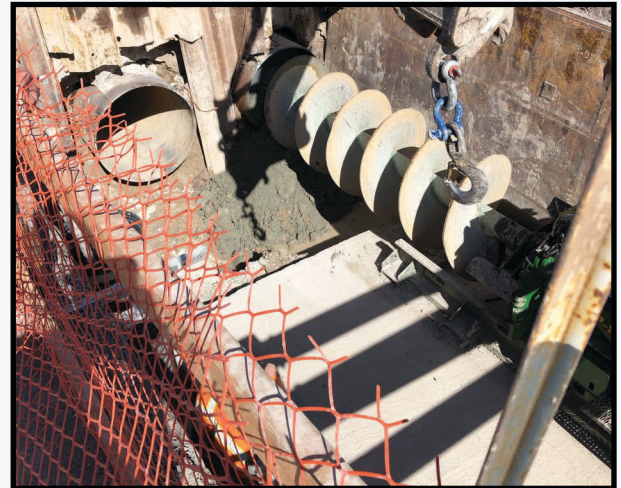
Cleaning out of 48-inch x 80-foot casings with our augur bore machine.