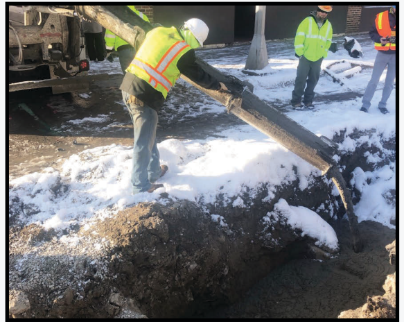
Pouring flow fill in MDT right of way.

Subcontractors on the project were Studer Construction and Highmark Traffic Service. Suppliers on the project were Northwest Pipe and Billings Construction Supply.