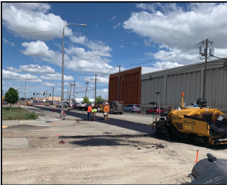
Paving the east portion of the project.