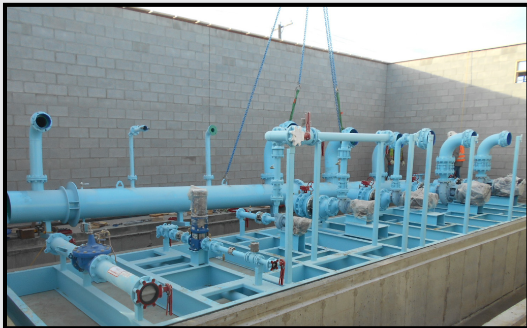
Installing the new skid mounted pump station in the building.