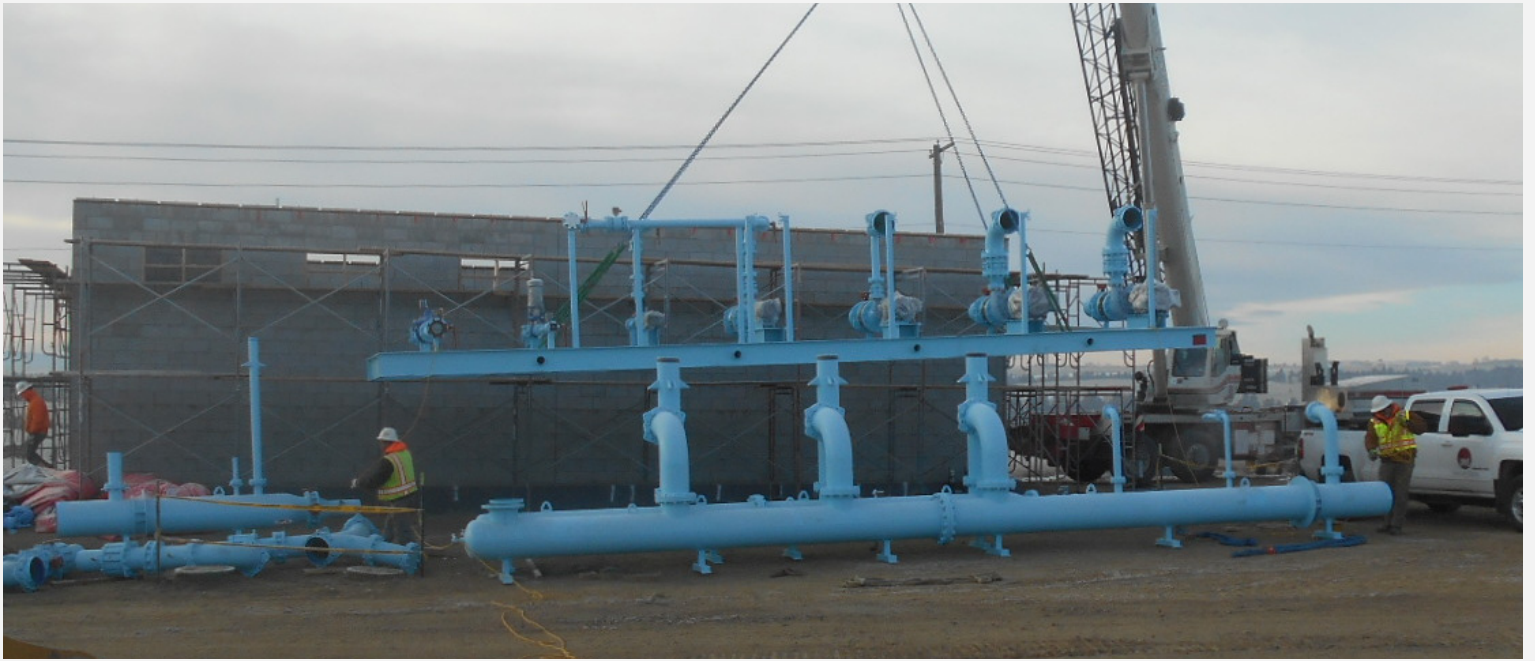
Installing the suction line.