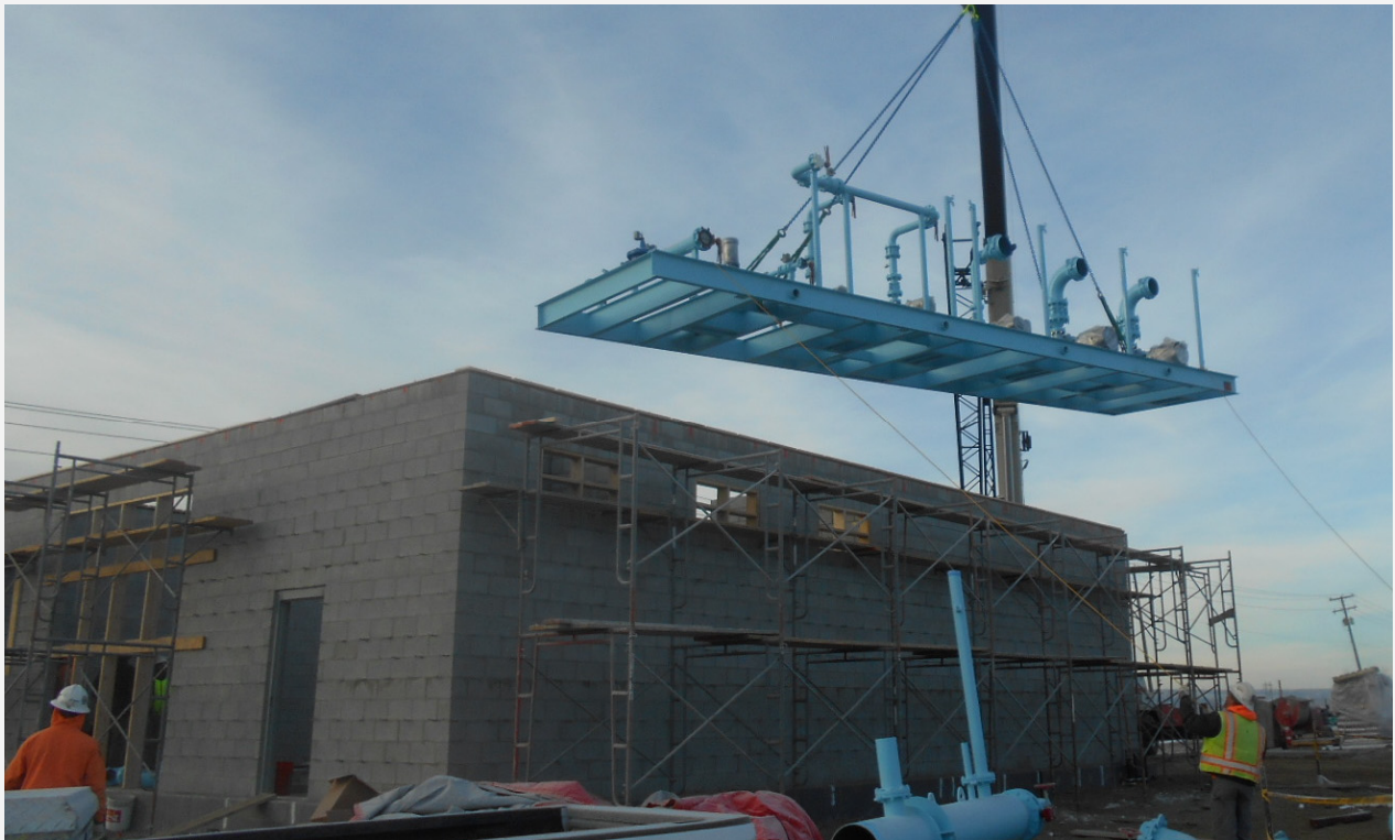
Installing the manufactured pump skid into the new building.